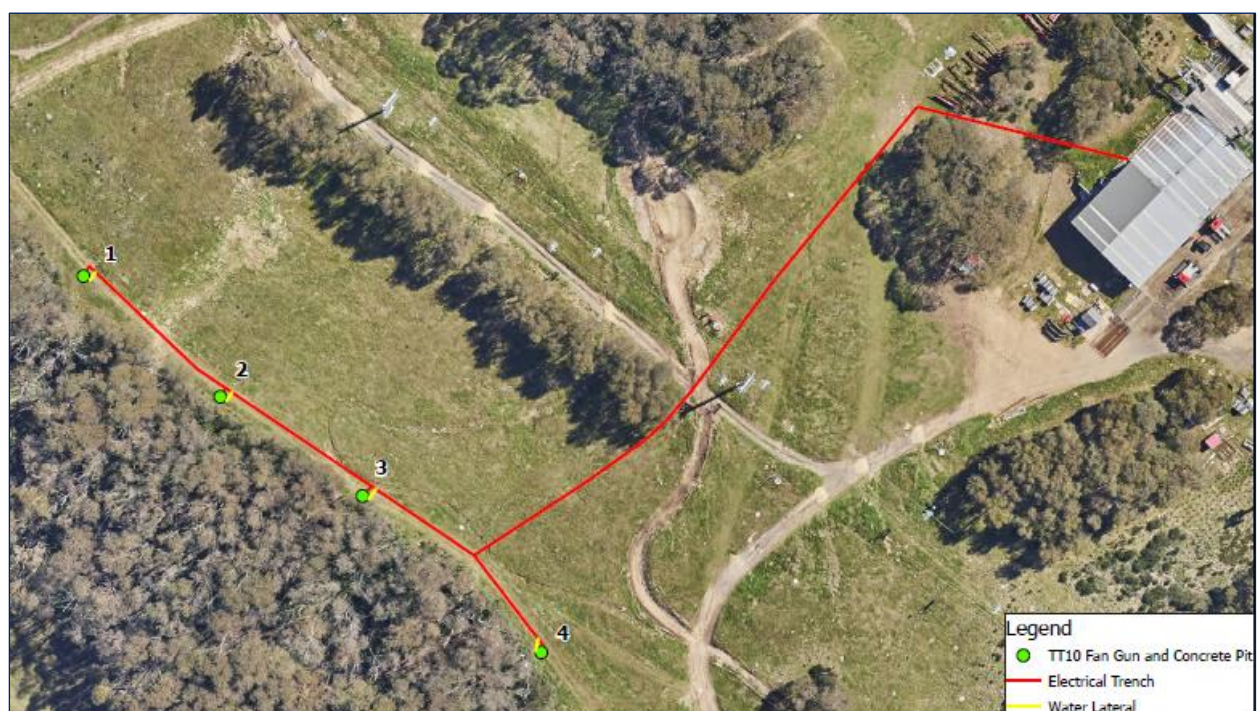
Figure 3 | Middle Slopes work site

The proposed modification to the consent is supported.